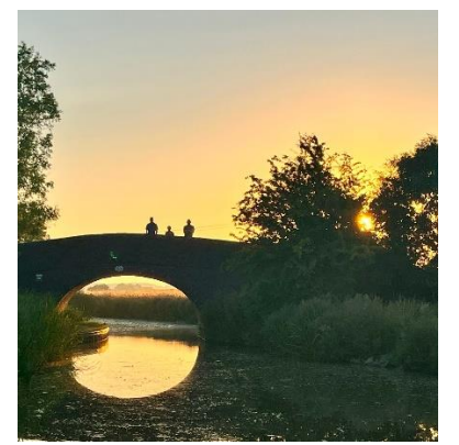
Sunrise over the Ashby Canal. Plus support team