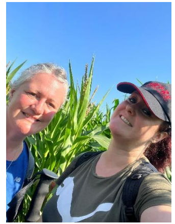
Hot in the maize!