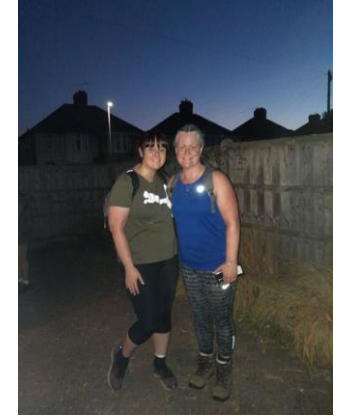
4.55am, and they're off!