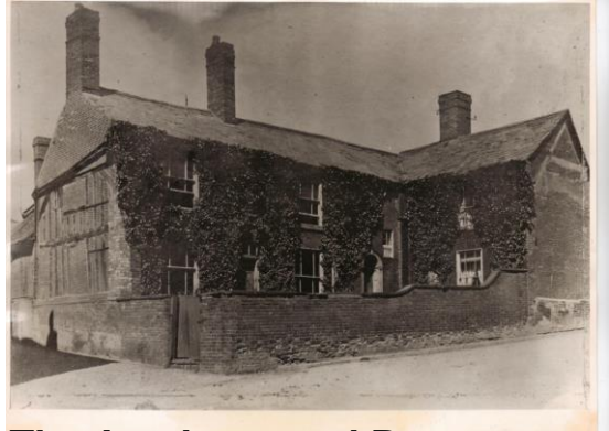
The Academy and Parsonage