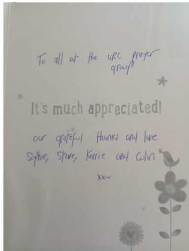
Permission has been granted to show these pictures.